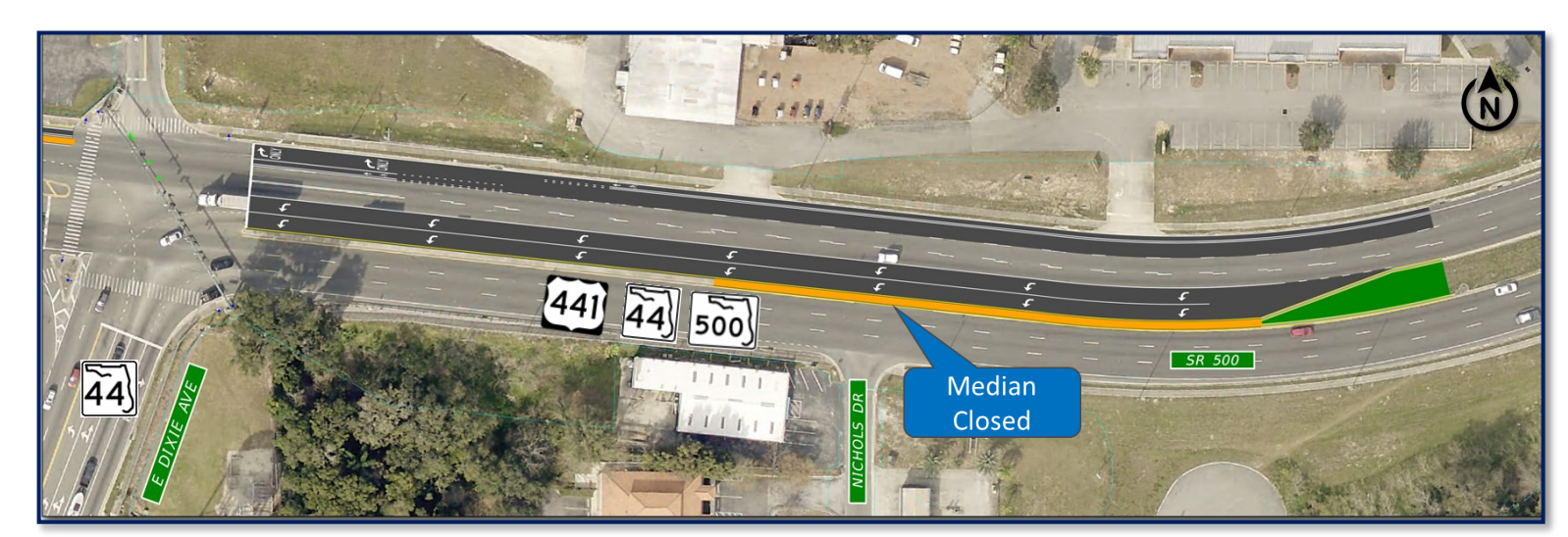
Figure 1: Extended Dual Left-Turn Lane at S.R. 44 (East Dixie Avenue) with Median Modification