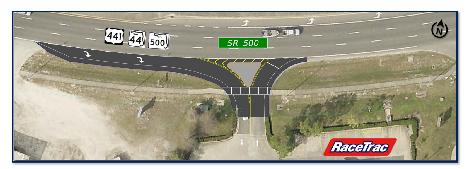
Figure 2: Dedicated Right-Turn Lane at RaceTrac