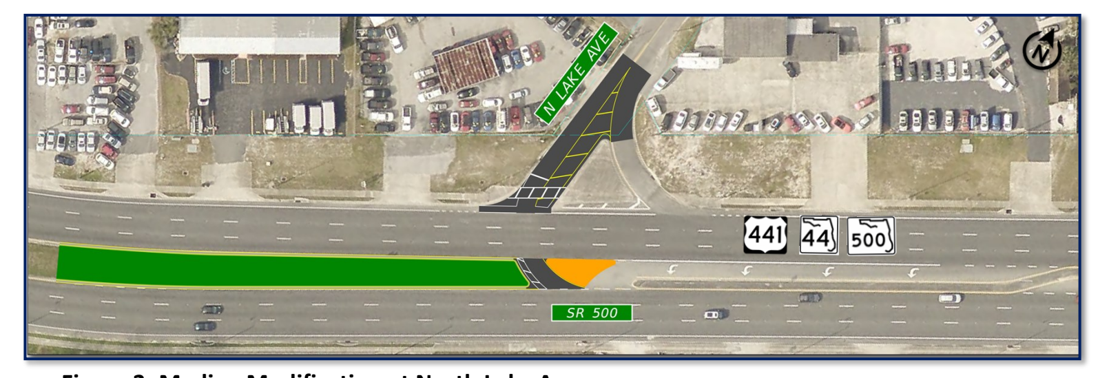
Figure 3: Median Modification at North Lake Avenue