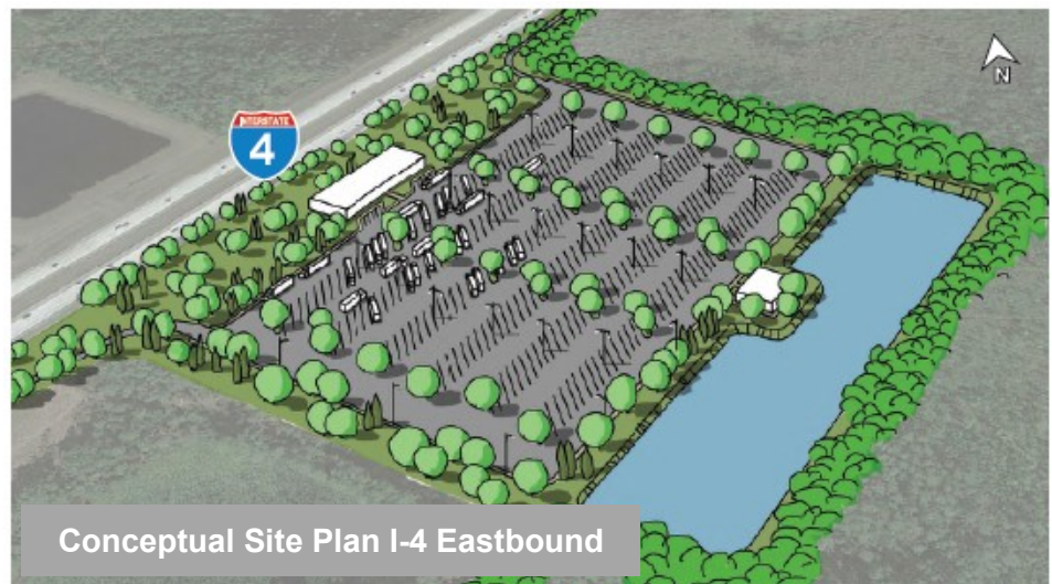
Conceptual Site Plan I-4 Eastbound