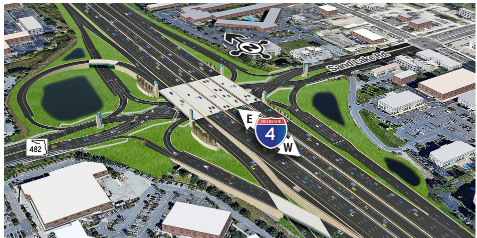
The design for this project is ongoing. The final configuration of the interchange will be similar to what is shown in this rendering, but small refinements are anticipated.

Implementing the Sand Lake Road DDI during the project's construction phase will give crews space to work in the median of Sand Lake Road. Crews need this room to reconstruct the I-4 general use lanes and extend I-4 Express – the two tolled managed lanes in each direction in the center of I-4 – over Sand Lake Road.